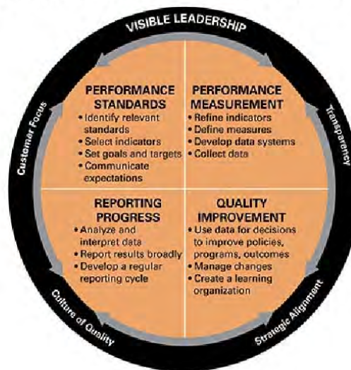
PUBLIC HEALTH PERFORMANCE MANAGEMENT SYSTEM

This includes the creation of a bi-monthly newsletter dedicated to informing the Public Health workforce of ongoing Q.I projects, implementing at least two staff Q.I trainings each year, and establishing the use of Q.I tools such as a Plan, Do, Study, Act, (PDSA) cycle to address and solve issues within individual programs. These steps have been implemented to train staff of the important role quality improvement processes play in improving the overall efficiency of Public Health programs.