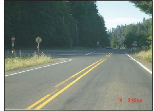
Southbound OR 229 Approach