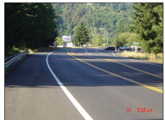
Westbound US 20 Approach