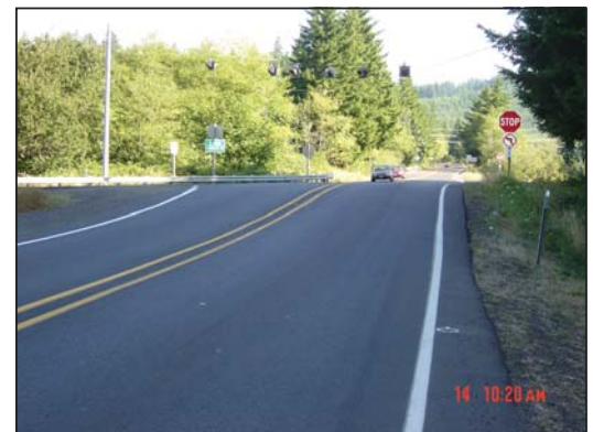
Northbound OR 229 Approach