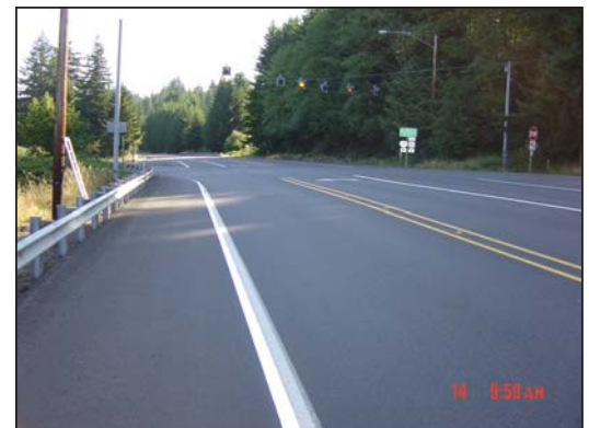
Eastbound US 20 Approach