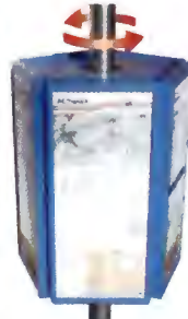
ROTATING 5 & 6-SIDED