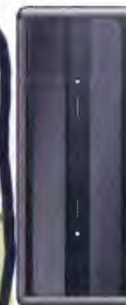
RCH-22 8 1/2" x 22" DISPLAY