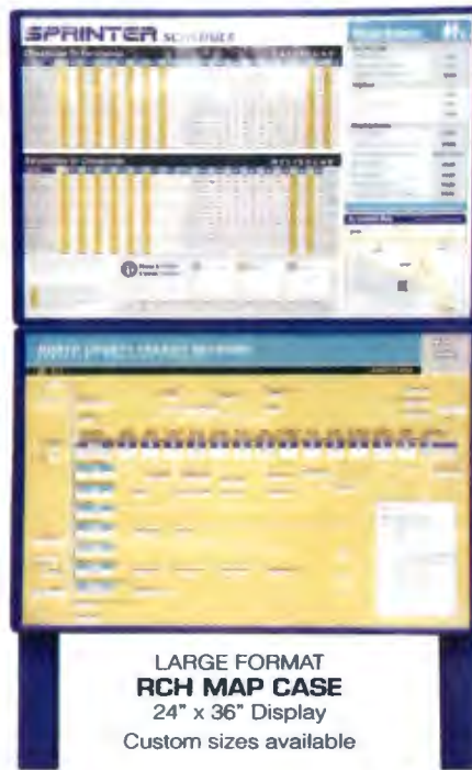
LARGE FORMAT RCH MAP CASE 24" x 36" Display Custom sizes available